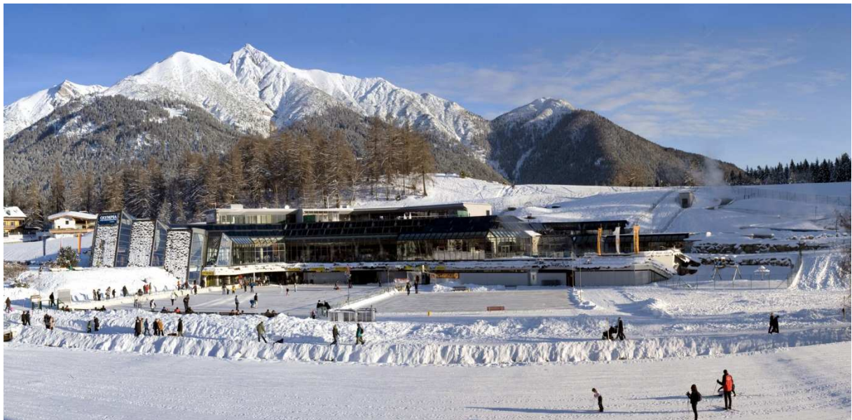
Sports and Congress Center Seefeld